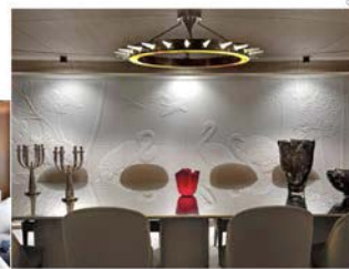
Eodem modo typi, qui nunc nobis videntur parum clari, fiant sollemnes in futurum.