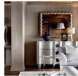
Eodem modo typi, qui nunc nobis videntur parum clari, fiant sollemnes in futurum.