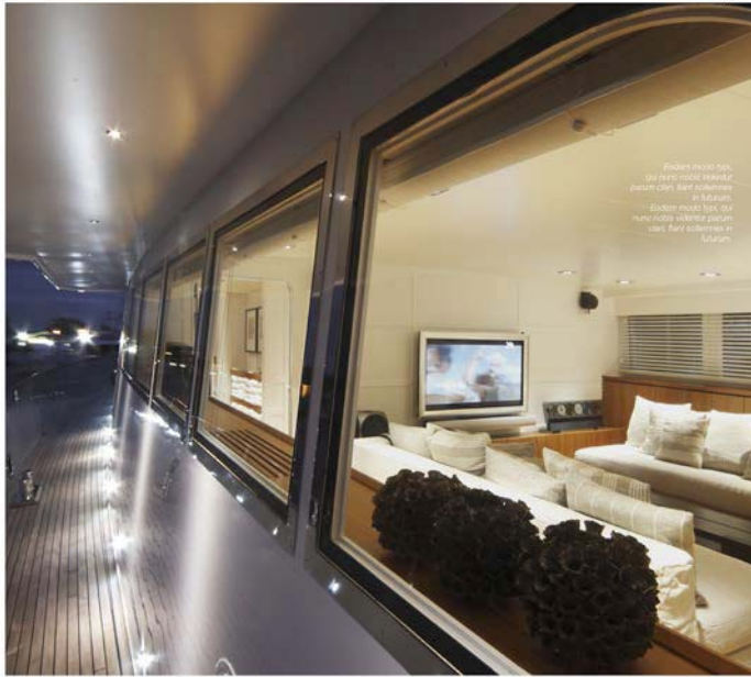
Eodem modo typi, qui nunc nobis videntur parum clari, fiant sollemnes in futurum.

Il mare è un mondo infinito, un mondo che si vive in ogni momento della navigazione. È un'emozione che si vive in ogni momento della navigazione. È un'emozione che si vive in ogni momento della navigazione.